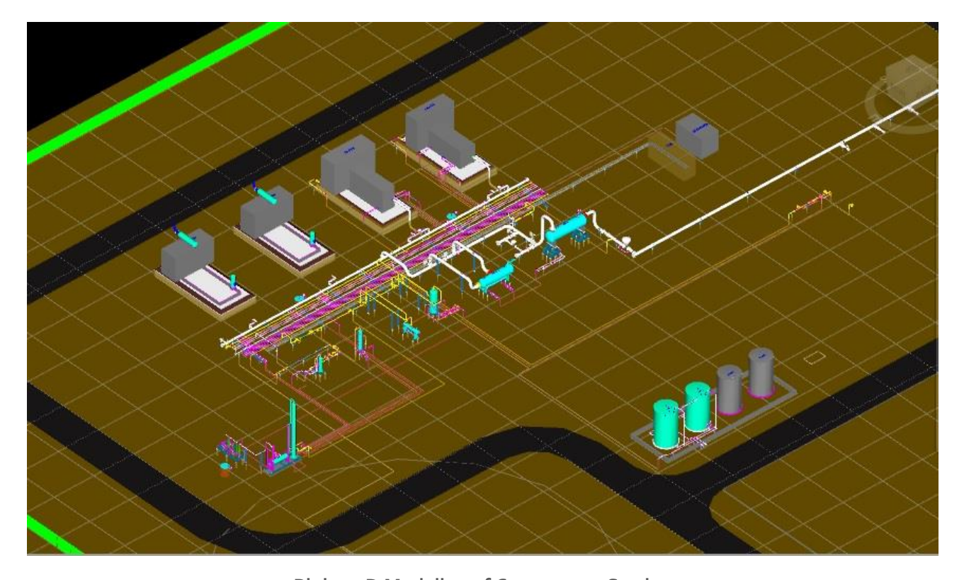
Piping 3D Modeling of Compressor Station