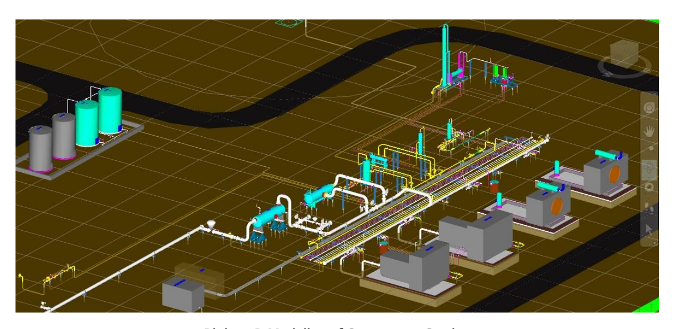
Piping 3D Modeling of Compressor Station